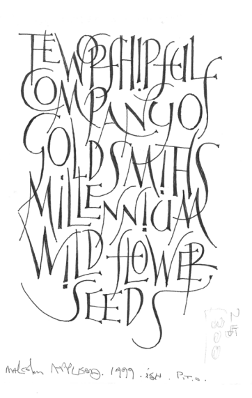
Drawing for seed packets by Malcolm Appleby