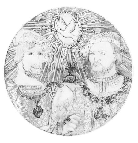
Design drawing by Nicola Moss

low relief to suggest depth and distance, Moss shows a splendid royal tournament around the Tree of Honour. The obverse, by contrast, presents the two kings in high relief, accompanied by the dove of peace and a hawk. Timothy Schroder comments: 'This collection of motifs – the tournament, the kings, and the mixed messages of war and peace – sum up the brilliance, the hope and the failure of the Field of Cloth of Gold.'