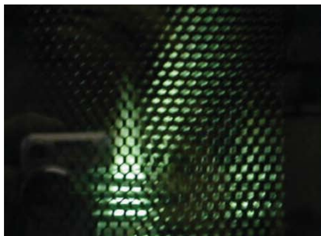
ICP OES Technique